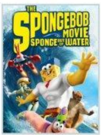
SATURDAY, JULY 23 Doors open at 7:45pm Movie begins at 8:15pm Run Time: 93 minutes