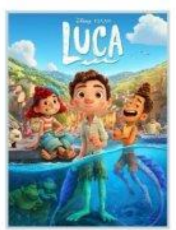
SATURDAY, SEPTEMBER 24 Doors open at 6:45pm Movie begins at 7:15pm Run Time: 101 minutes

Pre-registration $5.00 Register at Door $7.00