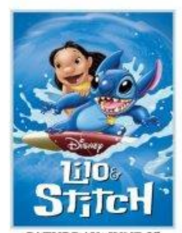
SATURDAY, JUNE 25 Doors open at 7:45pm Movie begins at 8:15pm Run Time: 85 minutes