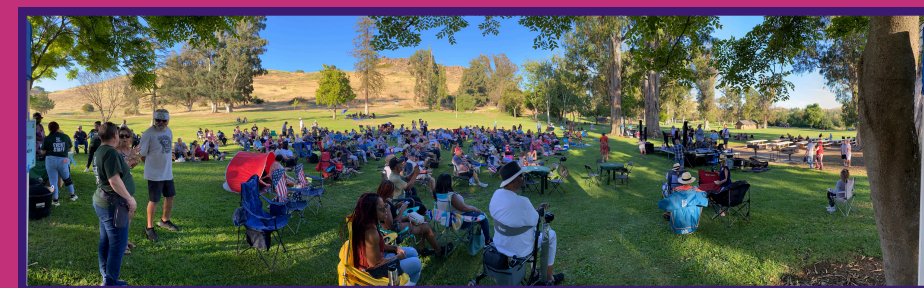
COMMUNITY EVENTS & DONATIONS